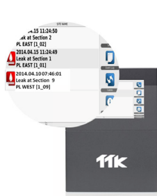
Simultaneous alarms displayed on one screen