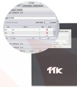
Easy setup of relays for each cable